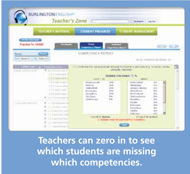
Teachers can zero in to see which students are missing which competencies.